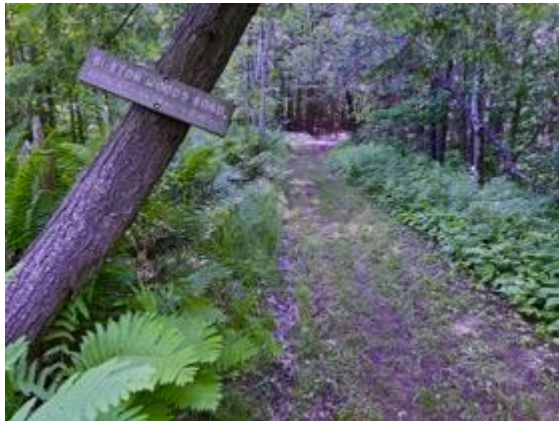
Lower section is normally poorly drained.