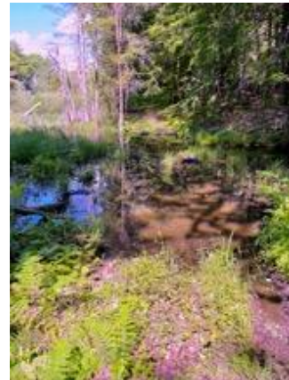
The "road" passes through a beaver pond.