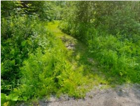
Entry from Bragg Hill Road is narrower than a vehicle

Images were shot on 20 June 2021 during semi-drought conditions.