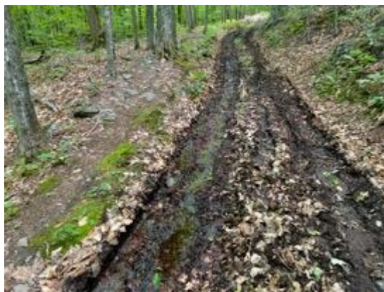
Multiple sections of ROW are wet and drain through tire ruts.