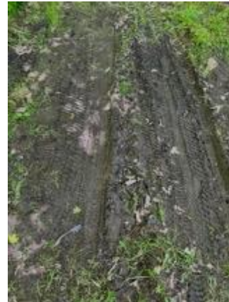
Traffic observed was mostly mountain bikes.