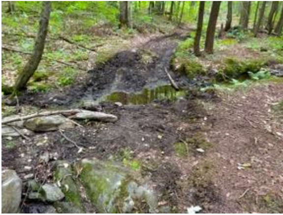
This stream crossing near the ridge is usually much wetter.