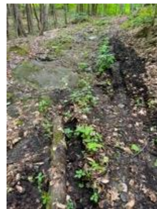
Steep, rocky sections compromise vehicle passage.