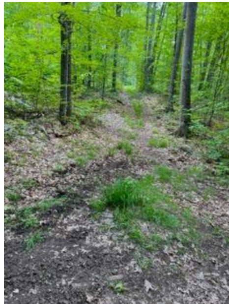
The trail leading north at the junction