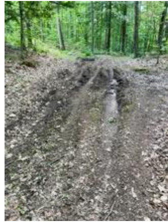
The junction at the top of the proposed re-classification