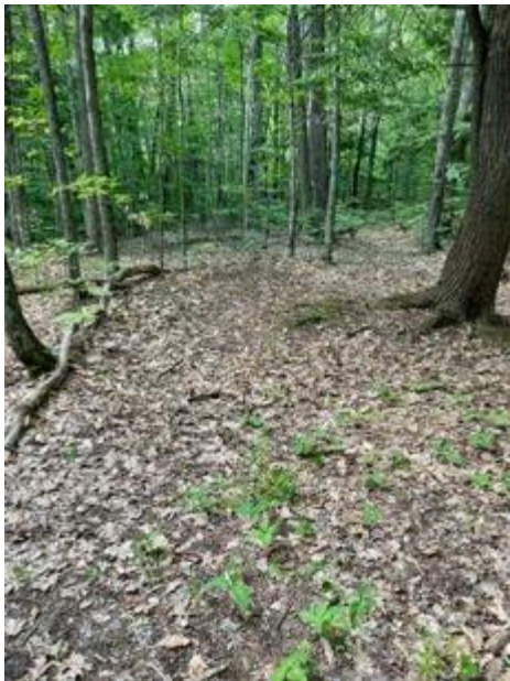
The trail leading south at the junction